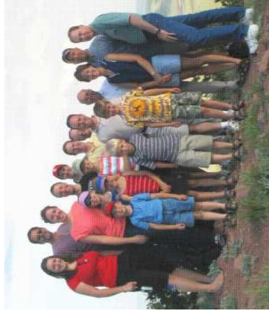
2005 Seminar Class (and kids)